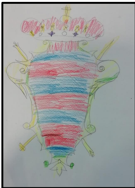
Lota, 1.r., Dubrovnik